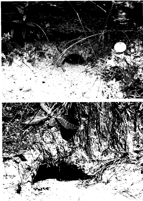
Figure 1. Representative habitat structures observed at gopher tortoise burrows in the Conecuh National Forest, Alabama. Top: Juvenile burrow located at a pine log (7 cm burrow width). Bottom: Adult burrow located at a tree stump (25 cm burrow width).

study area). On the CNF, gopher tortoises 1–9 yrs of age may fall within the size range (5.8–13 cm carapace length) of the juvenile stage (Aresco and Guyer, 1998). Burrow width is tightly correlated with carapace length (CL) of the resident tortoise (Martin and Layne, 1987; Wilson et al., 1991). Therefore, I classified burrows as either juvenile (< 14 cm in opening width) or adult based on the width of burrow entrances. In most cases, these were confirmed by actual captures via live traps. A few of the smallest burrows (< 6 cm in opening width) were constructed by hatchlings (0–1 yrs; 4.8–5.5 cm CL), but for the purposes of this study these were pooled with juvenile burrows.