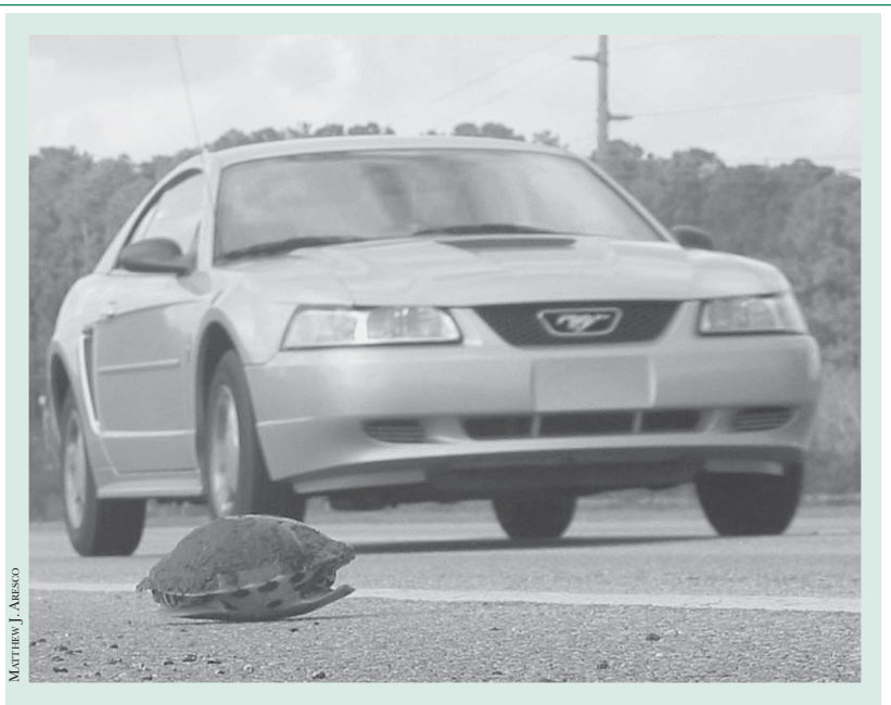
Turtle populations may not be able to compensate for sudden or chronic losses of large numbers of breeding adults. Even small increases in the annual mortality rates of mature females can lead to long-term declines.

killed during both periodic dry-downs and in years of normal lake levels. The mass migration and mortality at U.S. Highway 27 represent turtles from at least 25% of the total lake area (1000 acre northwest sub-basin); the loss of 25% of the entire turtle population every 12 years due to traffic mortality is a severe bottleneck event and a population sink (an area in which high mortality or low reproduction causes a local population decline). At Lake Jackson, 6-22% of females in each population are killed annually along the highway during nesting